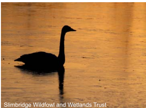
Slimbridge Wildfowl and Wetlands Trust